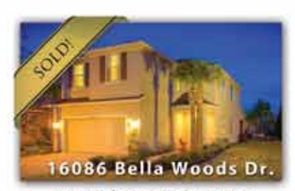
4/2.5/2 | 2310 SF $260,000 Gated | Maintenance Free