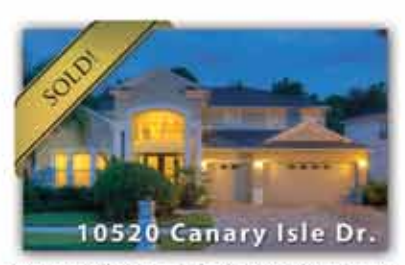
4/3/3+Office+Loft | 3424 SF $418,070 Two Story | Pool | Master Downstairs