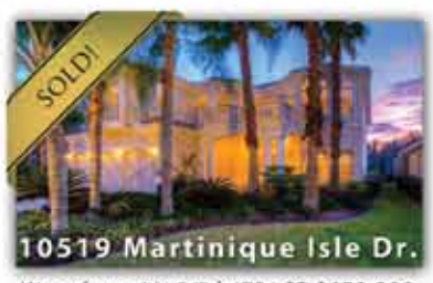
Waterfront 6/4.5/3 | 4704 SF $659,000 Pool | Dock