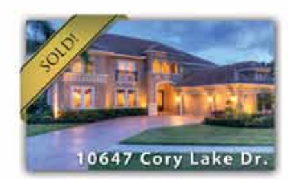
Waterfront 6/4.5/3 | 4335 SF $659,000 Outdoor Kitchen | Pool | Dock

Cell: (813) 380-3866 • Email: JudiBeck@msn.com