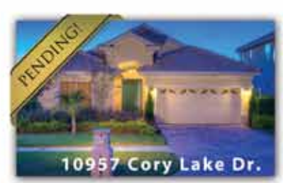
3/2/2+Bonus | 2111 SF $295,000 One Story | Pool | Waterfront