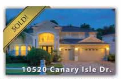
4/3/3+Office+Loft | 3424 SF $418,070 Two Story | Pool | Master Downstairs