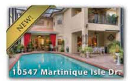
4/3.5/2 | 3975 SF $635,000 Two Story | Pool | Conservation View