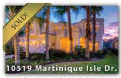
Waterfront 6/4.5/3 | 4704 SF $659,000 Pool | Dock