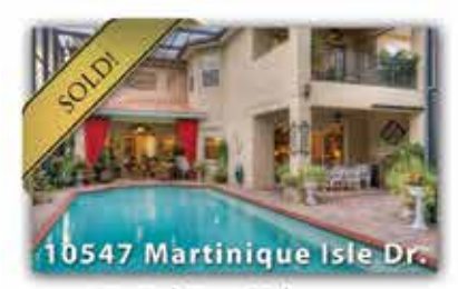
4/3.5/2 | 3975 SF $635,000 Two Story | Pool | Conservation View