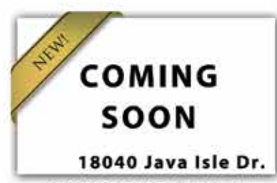
3/2/2 | 2002 SF $335,000 One Story | Pool | Waterfront