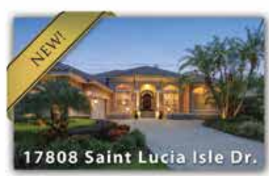
4/4/3 | 3818 SF $750,000 Outdoor Kitchen | Dock | Waterfront Pool and Spa