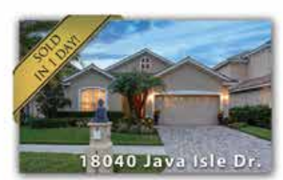
3/2/2 | 2002 SF $335,000 One Story | Pool | Waterfront