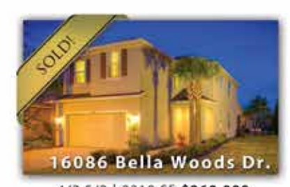
4/2.5/2 | 2310 SF $260,000 Gated | Maintenance Free