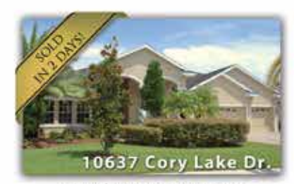
5/4/3 | 3676 SF $559,000 Waterfront | Pool & Spa | Dock