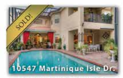
4/3.5/2 | 3975 SF $635,000 Two Story | Pool | Conservation View