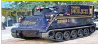
All Residents are Welcome to Attend! This is a great opportunity for a meet & greet as well as ask questions your local TPD!. Read a full article on our CDD website at corylakescdd.net

Mark Tuesday November 7th @ 7PM on your calendar to head over to the Beach Club for our Neighborhood Watch/Tampa Police Department Roll Call Event.